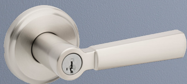
Perth Lever with SmartKey Security in Satin Nickel