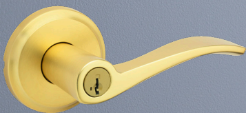
Sedona Lever with SmartKey Security in Satin Brass